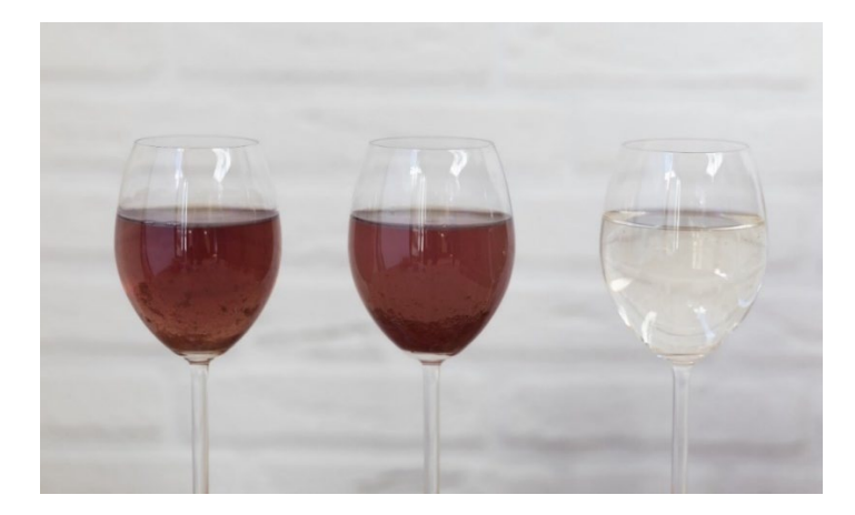
Figure 2 Dark brown precipitation of doxycycline after 24 hours if pH is too high.