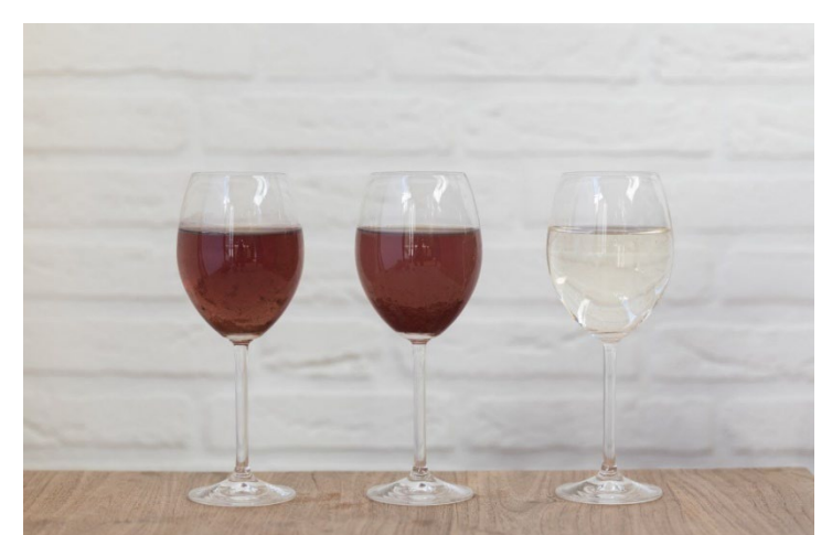
Figure 3 sedimentation of doxycycline within 24h when pH is too high.

Once the product is dissolved the active ingredient of course has to stay active for a sufficient amount of time. This is again depending on pH of the solution. Because pH can change over time due to exposure to oxygen in the air it is important to have sufficient buffering capacity in the solution. When buffering capacity is too low in doxycycline solutions the pH will increase within 24 hours leading to sedimentation (Fig 3).