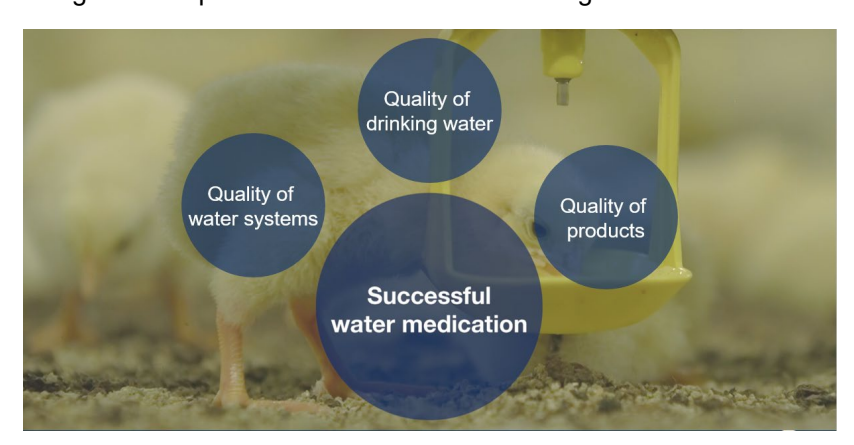
Figure 1 Requirements for successful drinking water medication.

In order to be successful with water medication you need good water quality, a proper drinking water system and products that have the right formulation (Fig1).